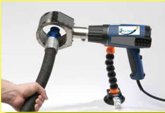
Pictured here: UC-HL1910E Heat Shrink Gun with UC-HG-Stand and UC-1.5HD Diffuser. Sold separately.